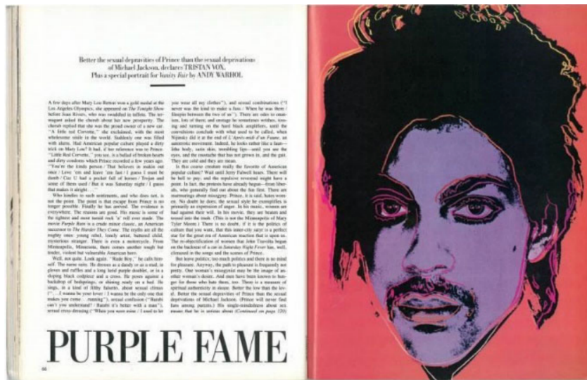
Figure 2. A purple silkscreen portrait of Prince created in 1984 by Andy Warhol to illustrate an article in Vanity Fair.