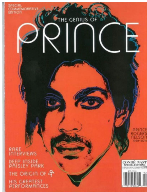
Figure 3. An orange silkscreen portrait of Prince on the cover of a special edition magazine published in 2016 by Condé Nast.

parent company, Condé Nast. See fig. 3, infra .