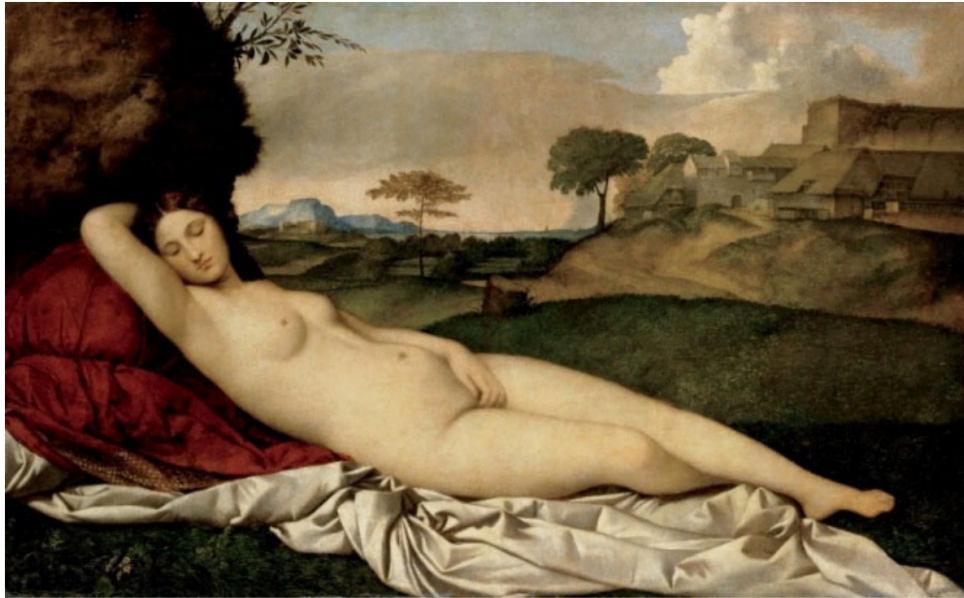
Giorgione, Sleeping Venus , c. 1510, oil on canvas