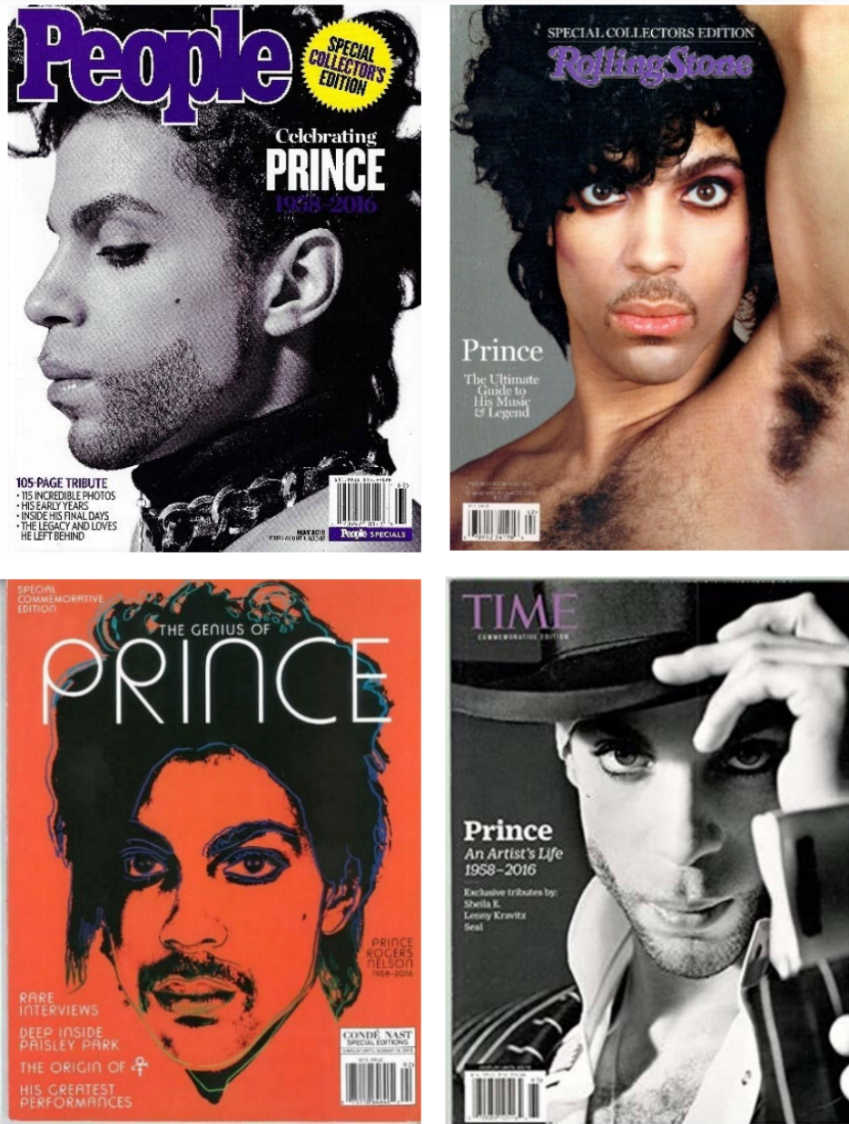
Figure 5. Four special edition magazines commemorating Prince after he died in 2016.