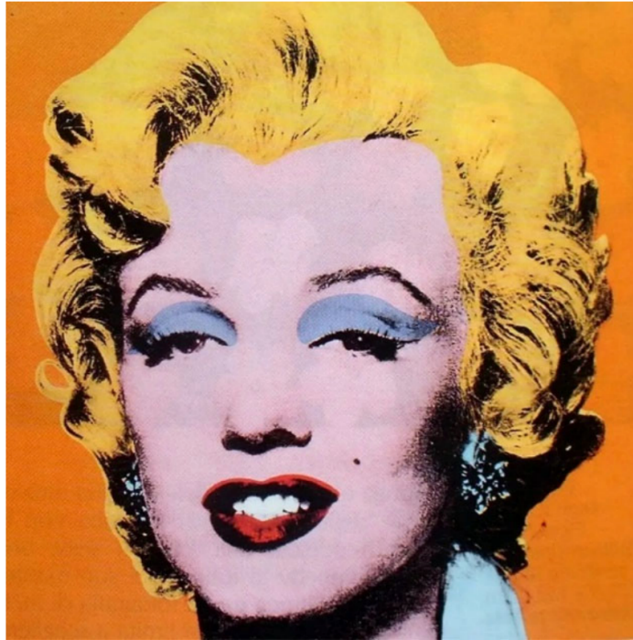
109 Andy Warhol, Marilyn, 1964, acrylic and silkscreen ink on linen

and use a squeegee to pull the ink through the weave and onto the canvas.” On some of his Marilyns (there are many), he reordered the process—first ink, then color, then (perhaps) ink again. The result—see for yourself—is miles away from a literal copy of the publicity photo.