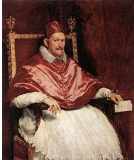
Velázquez, Pope Innocent X, c. 1650, oil on canvas