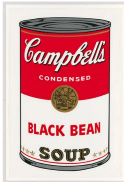
64 Figure 7. A print based on the Campbell’s soup can, one of Warhol’s works that replicates a copyrighted advertising logo.