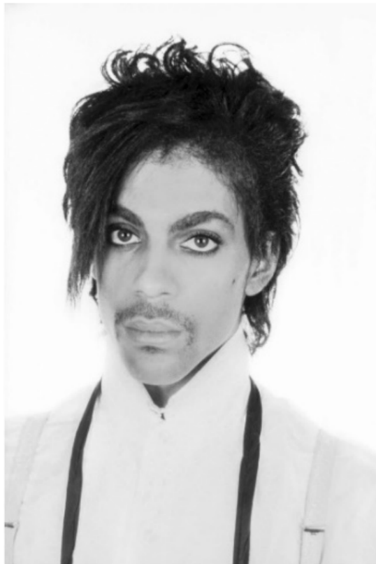
12 Figure 1. A black and white portrait photograph of Prince taken in 1981.