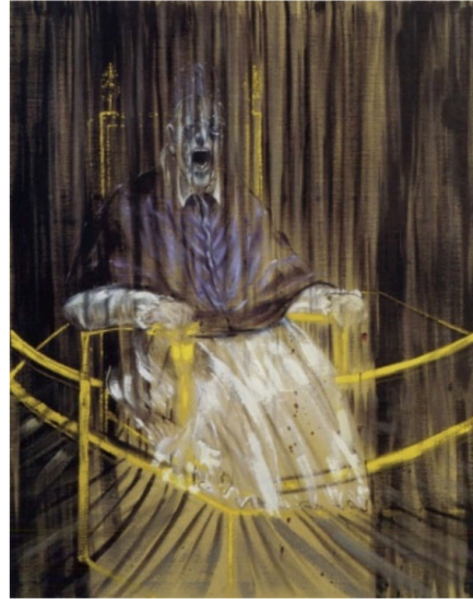
Francis Bacon, Study After Velázquez's Portrait of Pope Innocent X, 1953, oil on canvas