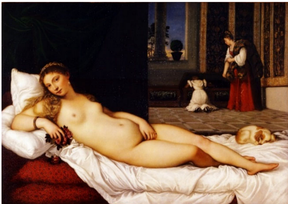
Titian, Venus of Urbino , 1538, oil on canvas