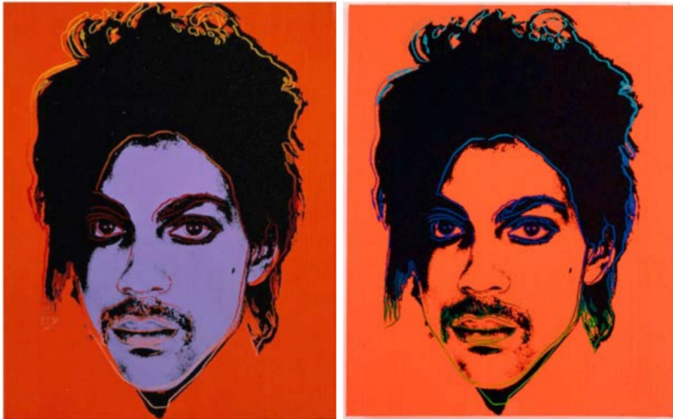
113 Andy Warhol, Prince, 1984, synthetic paint and silkscreen ink on canvas