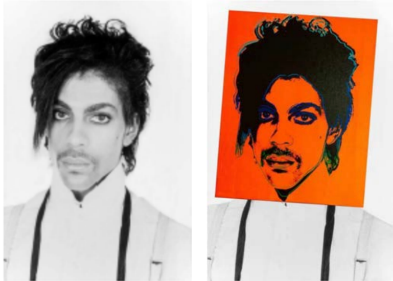
Figure 6. Warhol's orange silkscreen portrait of Prince superimposed on Goldsmith's portrait photograph.